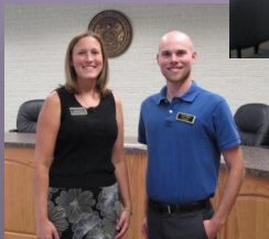
CHAMBER BUSINESS EXPO 2010